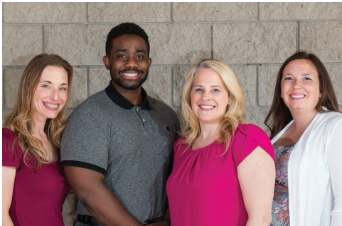
Our Pharmacy Team