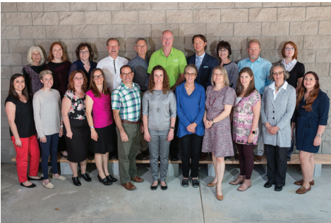
Our Medical Team