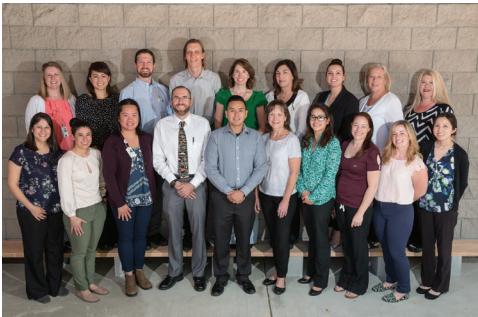
Our Dental Team